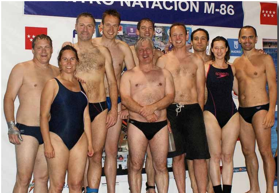
Madrid team on the podium