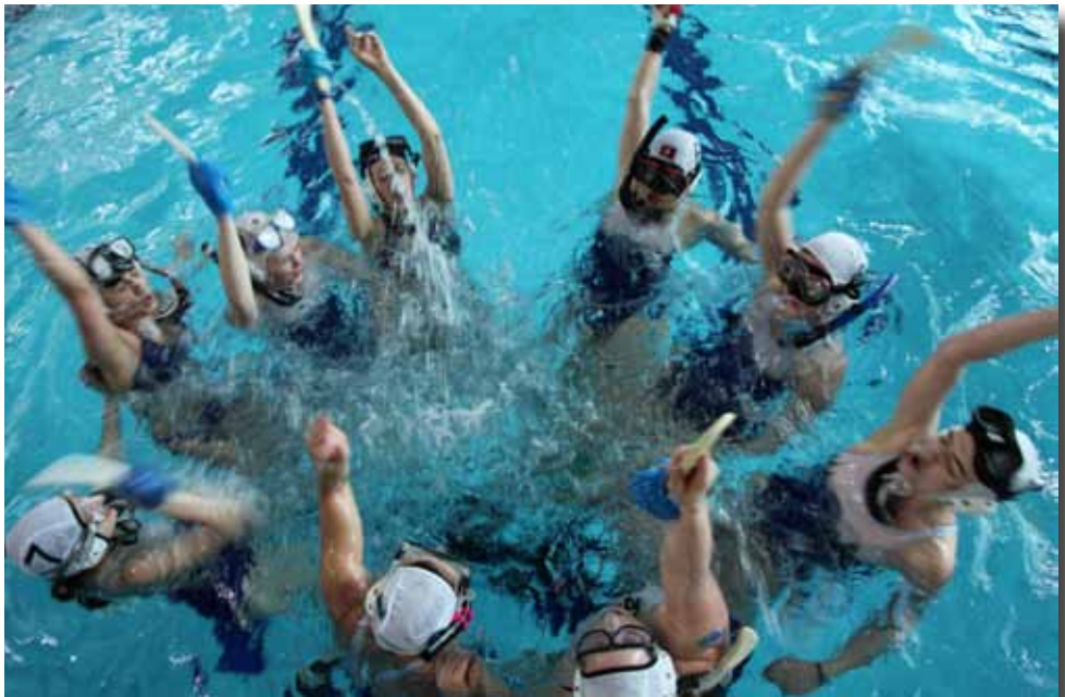
„Wa-a-a-hoo!“ before a game