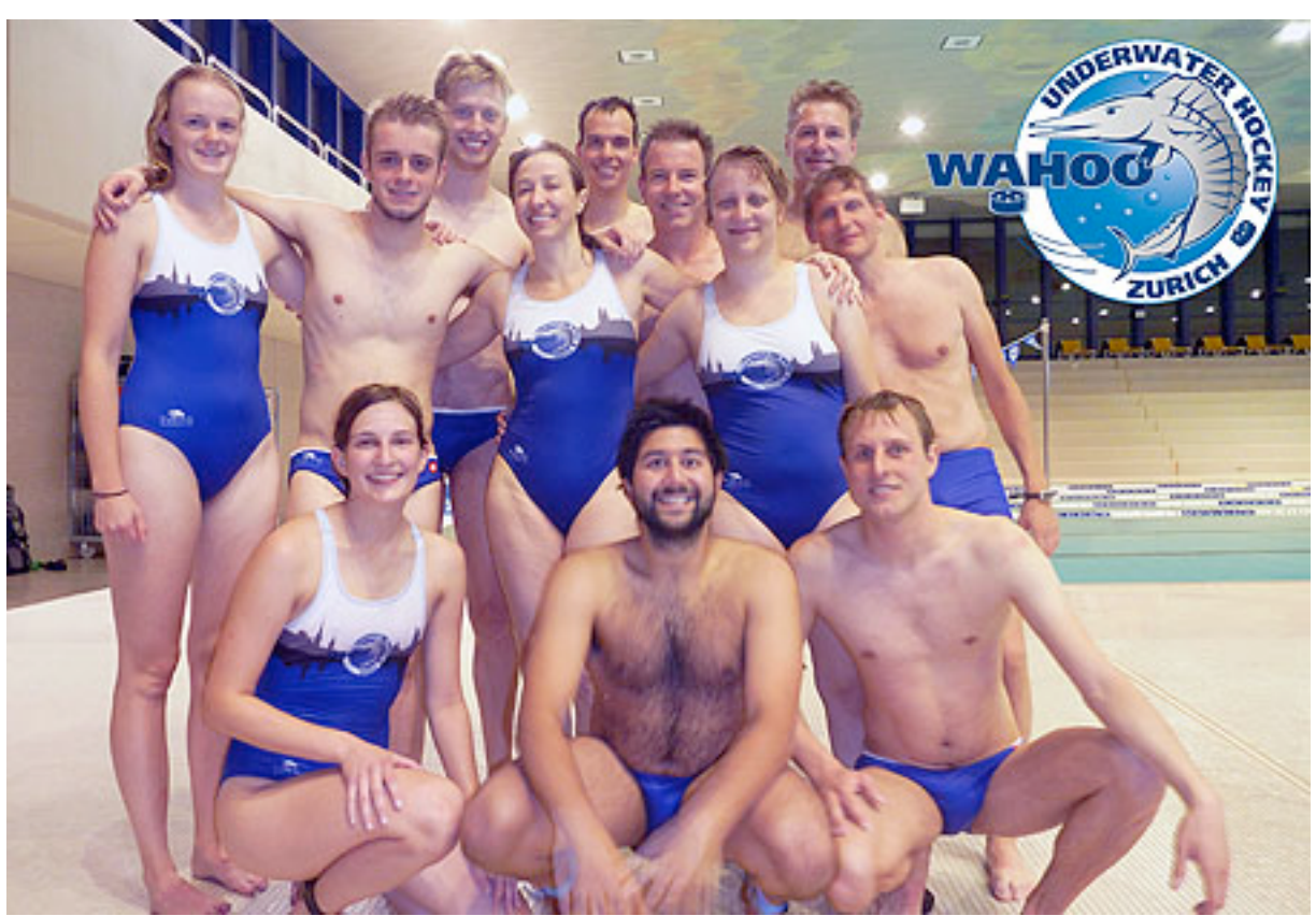
Wahoo Underwater Hockey Zürich

The first club to start in Switzerland, the Underwater Hockey group of USZ-Zürich, achieved massive growth, more than doubling in numbers during the course of the year, and went from a state where sometimes there were not enough players to have a full 6 vs 6 game, to club nights where two full games played at the same time has become commonplace.