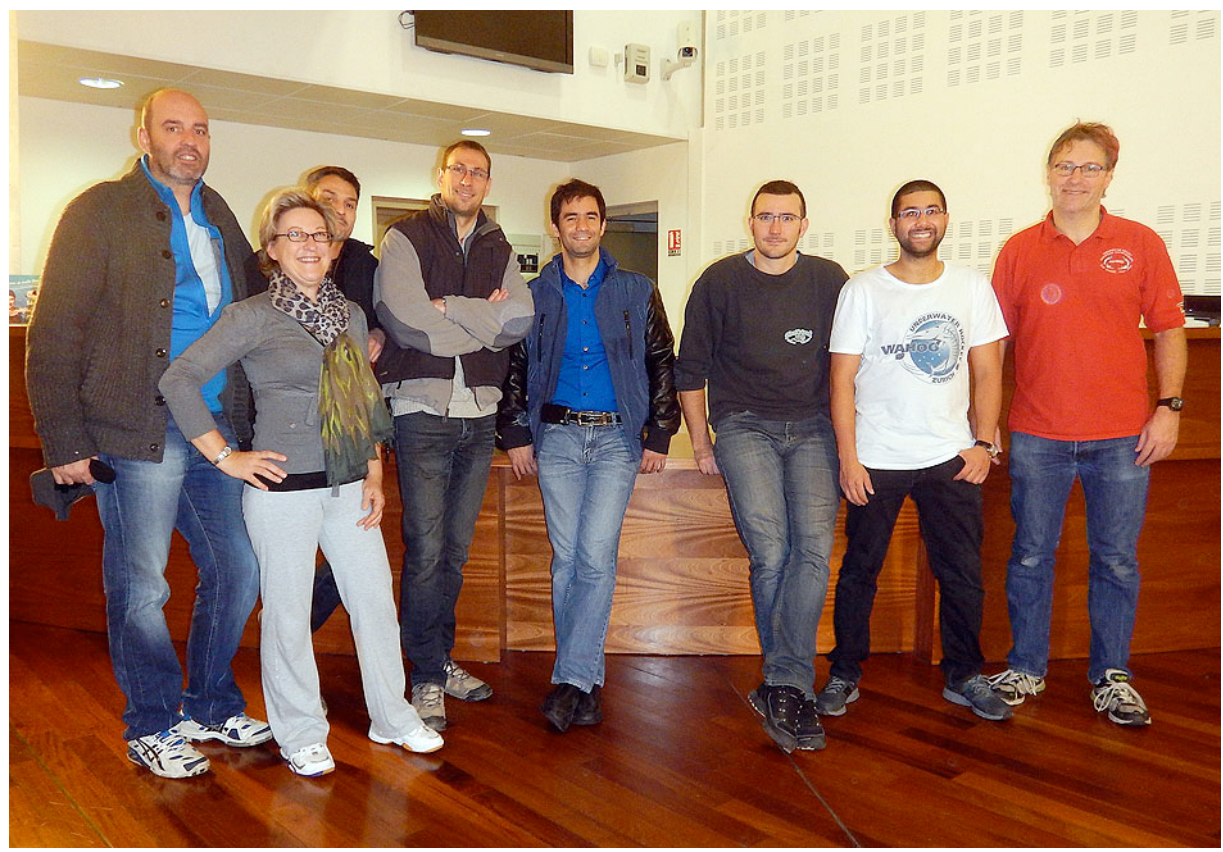
The participants of the first ever Underwater Hockey session of Underwater Hockey Basel / Plongeé des Trois Frontières

So we did create two new Underwater Hockey groups in 2014, and brought a number of new players into the sport, and therefore a number of new membership subscriptions into the host clubs. However, due to the lack of interest from Swiss clubs in trying something new, with the exception of the new members of USZ-Zürich, all of these new membership subscriptions are boosting the French federation (FFESSM), not SUSV. If the membership truly wants SUSV to survive and grow, the change - and the effort to make the change - has to start with the clubs.