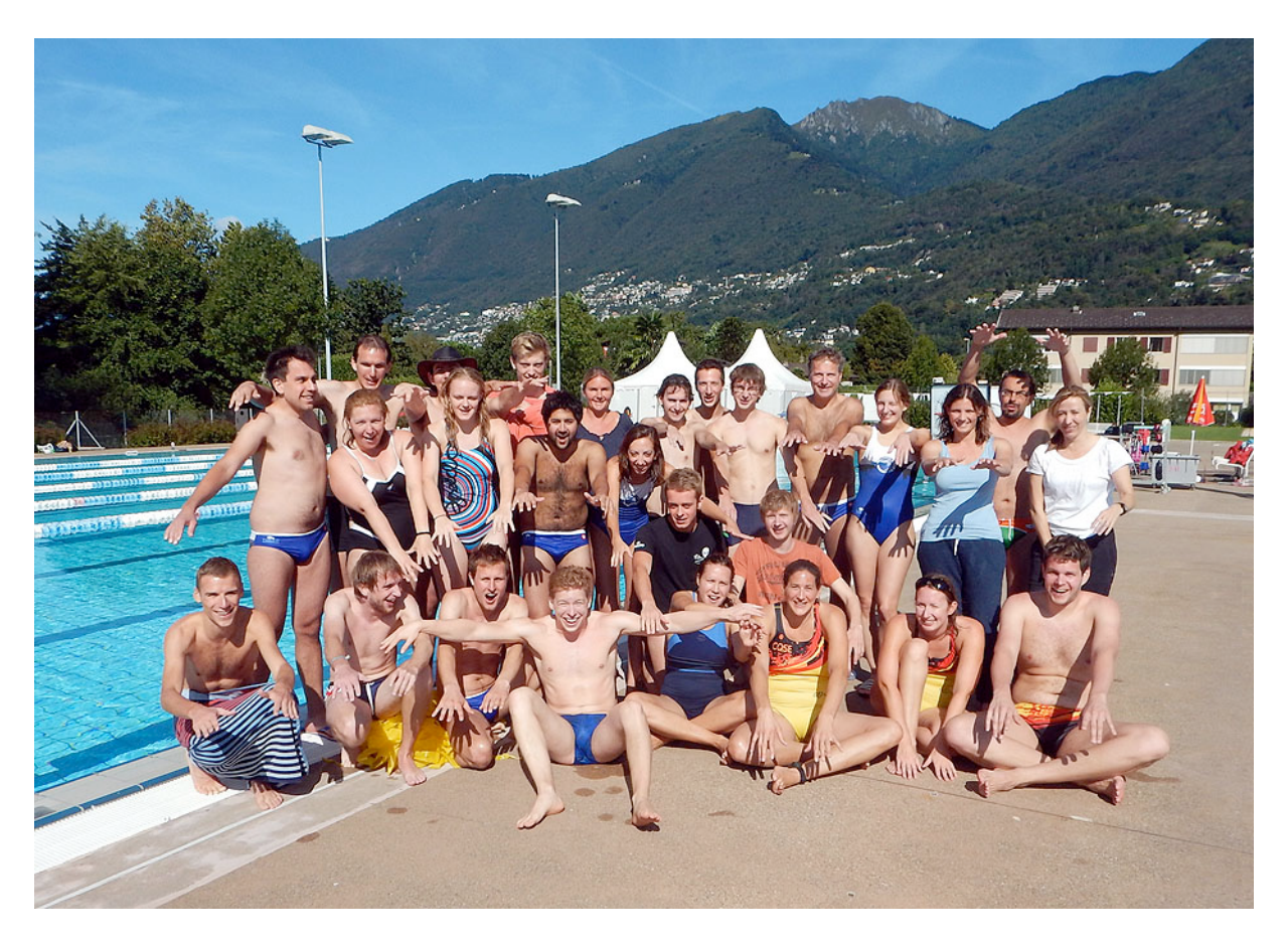
The 2015 camp has already been scheduled for the weekend of 28th-30th August, also in Tenero, and all are welcome.