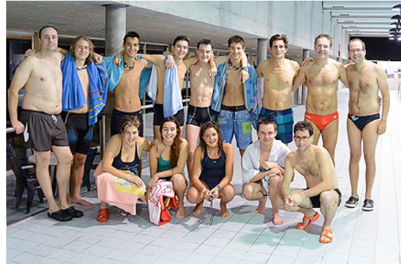
Demo to Bellinzona lifesaving club