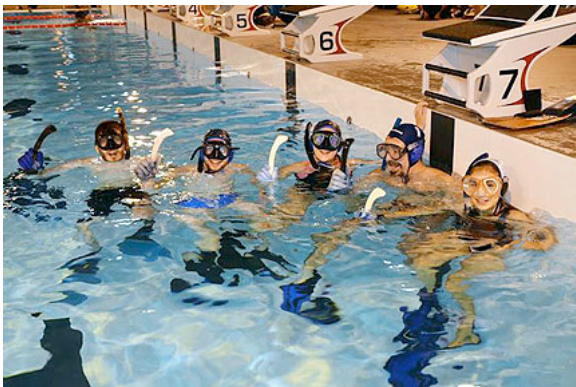
The Geneva / Annemasse group is growing!

The Geneva team, a part of the Exocet Lemane dive club from Annemasse, France, experienced rapid growth, and grew from just a few people at the beginning of the year to fourteen players by the close. Its players come from France, Switzerland, Portugal, South Africa and Poland, so the club is multicultural and multinational, with an age range from 15 to 40 years.