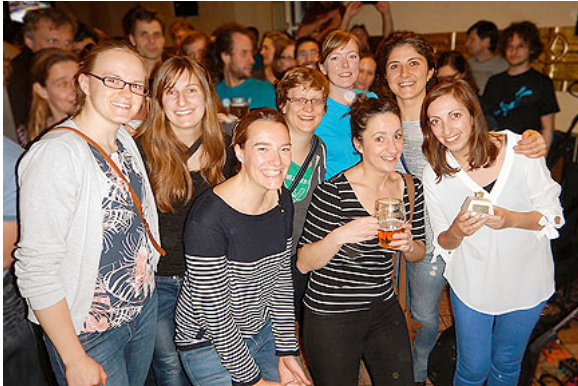
The first ever Swiss Ladies team