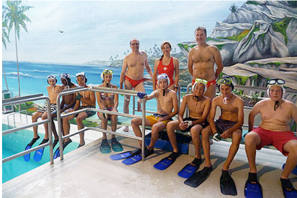
Demo to Wallisellen School, Zürich

We also held demonstrations at Wallisellen School in Canton Zürich and to the SLRG lifesaving club in Bellinzona. The response from the Bellinzona group was especially encouraging, and they have already requested four more demonstrations in the early part of 2016.