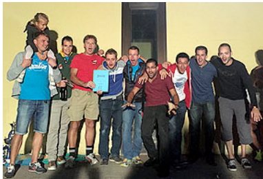
The Wahoo Men’s team in Parma