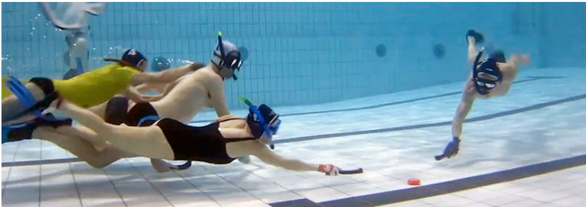
UWH Basel demonstrating Underwater Hockey to the Plongée des Trois Frontières finswimming group