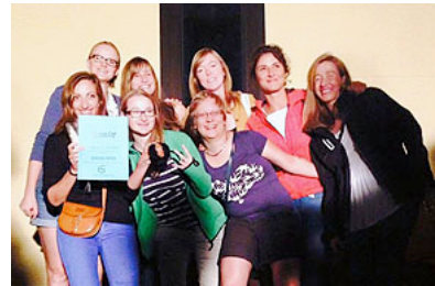
The Wahoo Women’s team in Parma

On the domestic front, we continued our efforts of trying to expand the sport by holding demonstrations around the country. We once again set up a stand at the Reussschwimmen annual river swim and handed out lots of flyers.