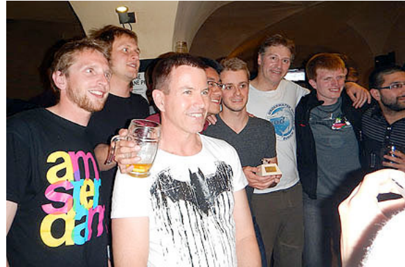
The first Swiss team ever to qualify for the top division of a multi-division tournament

The next tournament, in Mulhouse, France, brought the moment that we had been building towards for the last seven years: our first tournament victory! With 64 goals scored and zero against, in five games, it was an impressive performance. And once again we were able to field a women's team, which although it finished in last place, was the only women's team in the tournament, and still managed to score two goals against the Mulhouse Men's team, which finished in second place overall.