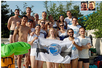
Wahoos in Munich

Two further major tournaments followed over the summer: the Munich Beer n’ Brez’n tournament in Peissenberg, Germany, and the Parmacup in Parma, Italy. For both of these tournaments we fielded two teams, which in Munich came 6th and 11th of 12, and in Parma the men’s team came 17th of 20 and the women’s team came 6th of 7.