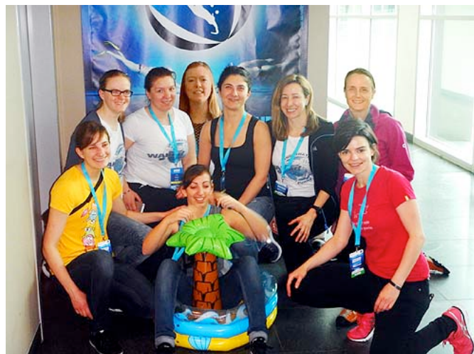
The first ever Swiss women's team at Euroclubs

Both teams finished in last place in both tournaments, but it was great experience for the teams, and especially for the newer players in the teams.