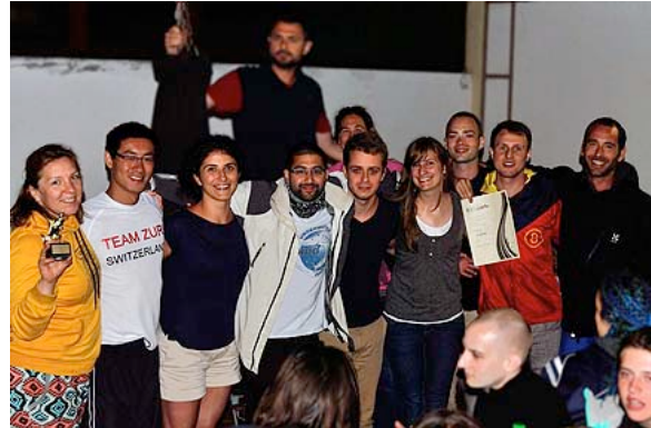
Winners of the Munich Tournament, June 2016

We also kept the existence of Underwater Hockey in Switzerland very much in the public eye around the rest of Europe, by maintaining our 100% attendance record at the Winter tournament in Grenoble, France, a repeat appearance at the long-running Memorial Mesareca tournament in Kranj, Slovenia, and a first appearance at the inaugural Budapest International tournament in Hungary.