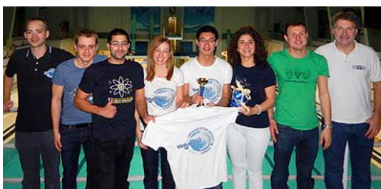
2 nd place in Turin, Italy

We closed the year with a visit to the third “Il Gianduiotto” tournament in Turin, Italy. We lost our first game to H.S. Ducale from Parma, the eventual winners of the tournament, but rallied well to win all of our remaining games, including a hard-fought match against Munich, to finish second out of eight teams.