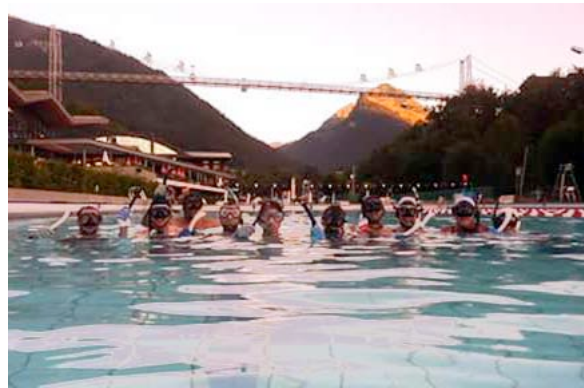
The "local derby" with Morzines

At national level, three of the Annemasse-Geneva ladies joined forces with the ladies team from Lyon, and qualified for the second division of the French national championships, where they finished fourth out of twelve teams. Four of the Annemasse-Geneva men joined forces with the second team of Grenoble, but were not successful in qualifying for the French championships. Nevertheless, aspirations are running high, and the team is looking forward to the challenges of 2017.