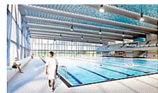
The planned 50m pool at Sursee

We were also invited to participate in and provide input to the design of a new national sports complex – "Campus Sursee" – in Sursee, near Luzern, in order to make it "underwater sport friendly".