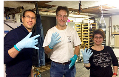
Making our own UWH gloves