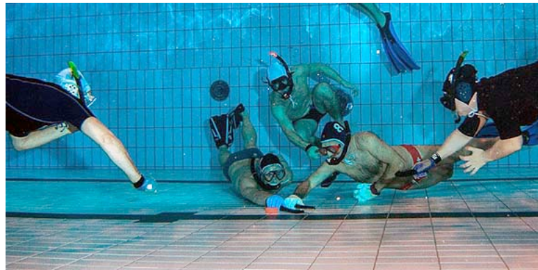
Basel Underwater Hockey Group club nights : it's all action!