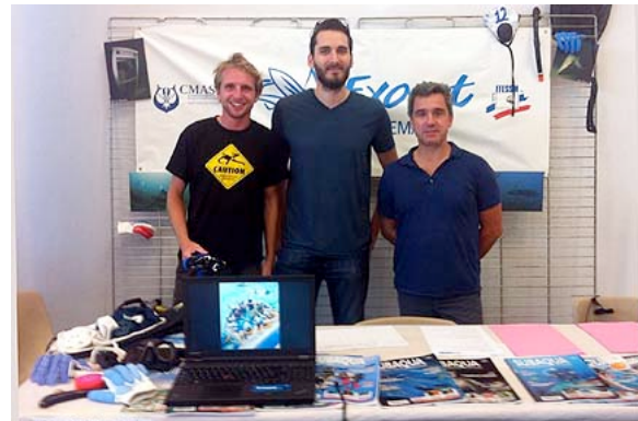
UWH at the Annemasse “Sport Associations Day”