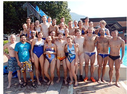
The end of a successful weekend