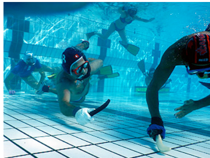
Practicing the new skills