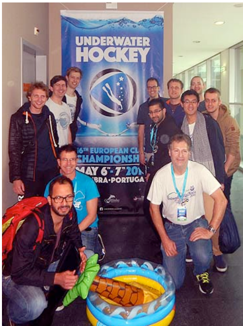
The first ever Swiss men's team at Euroclubs

2016 was the year in which Underwater Hockey Switzerland took another step closer to the big time, with first-ever appearances – with both men’s and women’s teams – at the European Club Championships in Coimbra, Portugal, in May, and at the long-running high-level Argonauta tournament in Breda, Netherlands, in September.