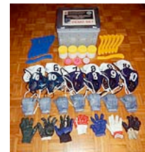
Schools demo set

The collaboration project with SwimSports, the Swiss governing body of swimming in schools, bore its first fruit, with the publication of an introduction to Underwater Hockey and the other SUSV sports (Apnea, Finswimming and Underwater Rugby) in SwimSports' annual news bulletin, followed by a week-long demonstration of the sports at a schools training camp at the "Sport and Holiday" sports centre in Fiesch (VS) in October.