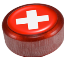
Underwater Hockey Switzerland www.uwh.ch

Representative, Underwater Hockey President of the Sport Commission Swiss Underwater Sports Federation