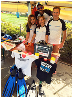
Open for business!

After a rain-drenched day in 2015, we were happy to have a return to “normal” Ticino weather, and more of the blazing sun and clear blue skies that we had experienced in 2014.