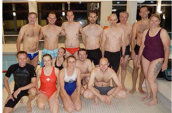
Demonstrating UWH to the apnea group of TSGB, Bern (BE)

The end of August once again saw an Underwater Hockey Switzerland training camp in Tenero (TI), which was attended by more than 25 players, from all across Switzerland, with visiting participants from Germany and a guest trainer from France.