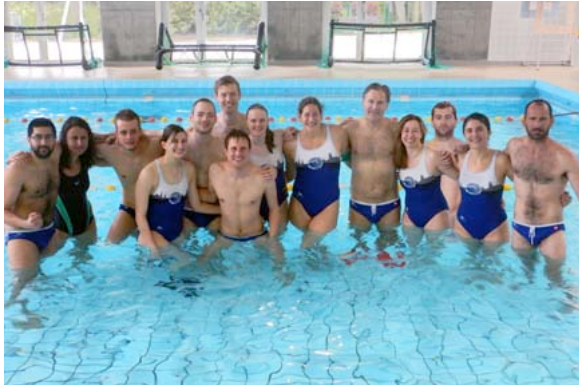
Winners of the Mulhouse Tournament, May 2016

However, there was better news, at the top end of the rankings table, where we followed up our first ever tournament victory, at the Mulhouse tournament in May 2015, by again taking first place at the same tournament in May 2016. A month later, we followed this up with a further victory at the Munich tournament, improving by two places upon our previous best in Munich – third in 2013.