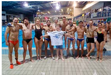
10 th place in Kranj, Slovenia