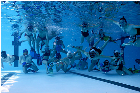
Demonstrating UWH in Annemasse in July