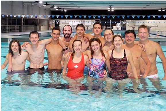
Demonstrating UWH to the lifesaving club in Bellinzona (TI)

We held more demonstrations to the SLRG lifesaving club in Bellinzona (TI), and also presented Underwater Hockey to the apnea group of the TSGB dive club in Bern (BE).